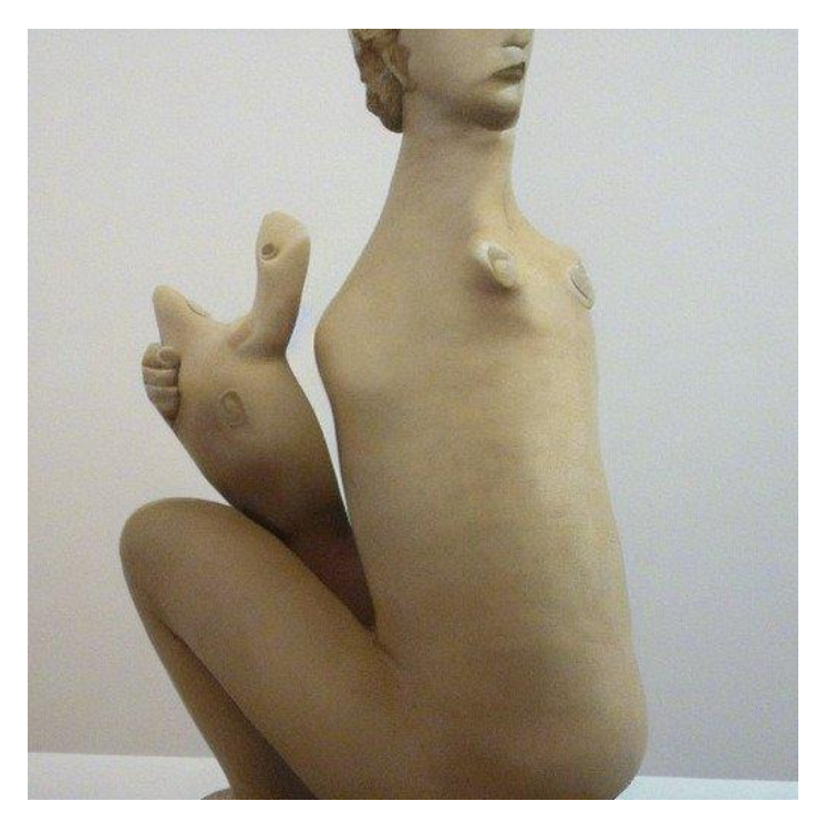
labor-painting and drawing application of the human body 2098: ilexv