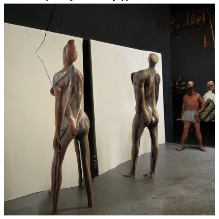
labor-painting and sculpture application of the human body 2097: ilevi

labor-painting and drawing application 2094: ilexii