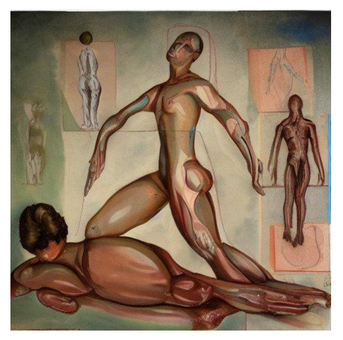
labor-painting and drawing of the human body 2064: ile