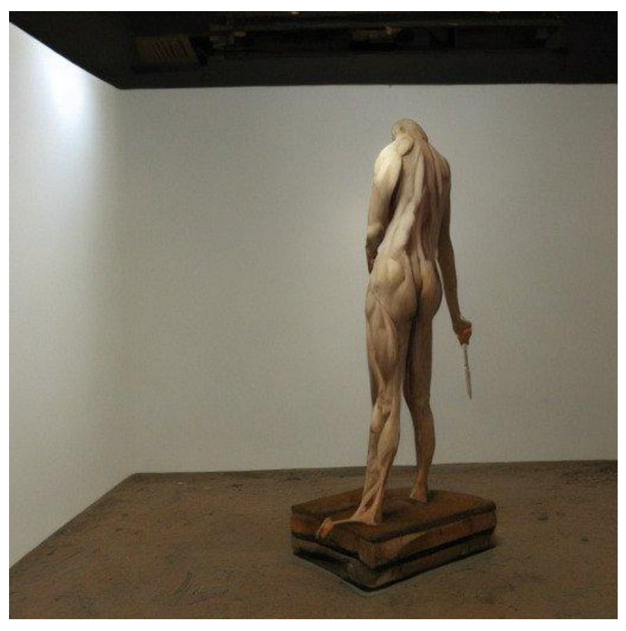
labor-painting, drawing and sculpture application of the human body 2087: ilex