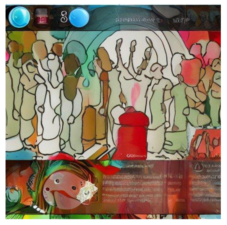
labor-painting and drawing application 2056: iale